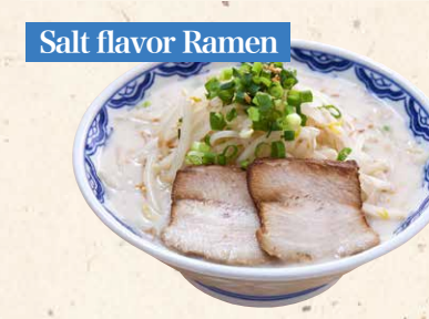
Salt flavor Ramen Soybean sprouts ramen 塩もやしらーめん 800