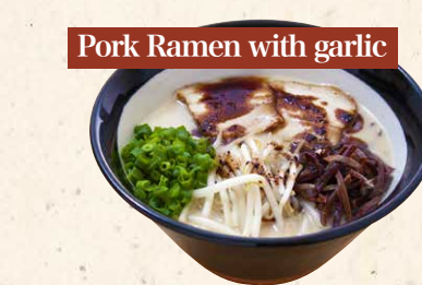
Pork Ramen with garlic Black ramen 黒らーめん 800