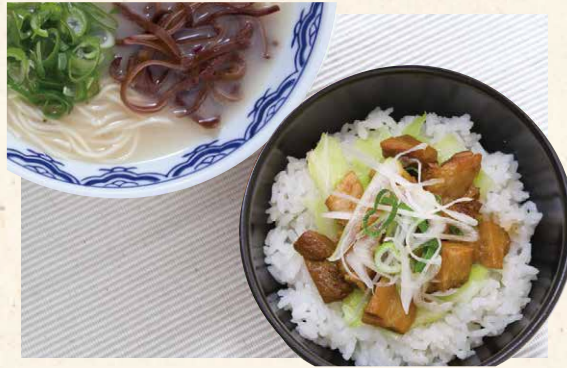
Diced pork topping 900 チャーシューごはんセット

We make our signature soup for 8 hours from carefully selected pork bone.