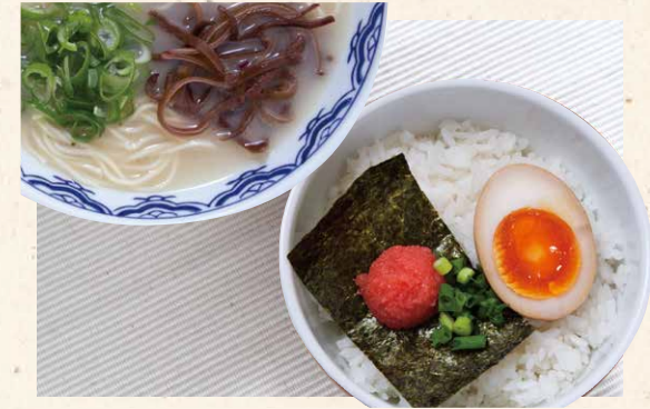
Mentaiko & flavored boiled egg topping 880 明太味玉ごはんセット