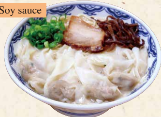
Wonton ramen 880 Famously tasty wonton. わんたん麺