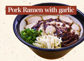
Pork Ramen with garlic Black ramen with Chashu(sliced pork) topping 黒チャーシュー麺 1000