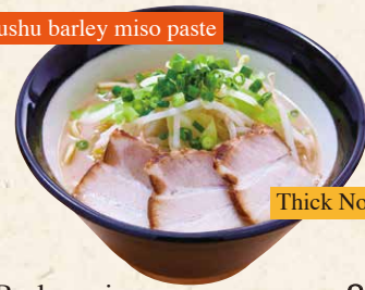
Barley miso ramen 880 A rich stock made with Kagoshima barley miso and served with thick noodles. 麦味噌らーめん