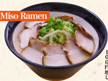
Miso Ramen Mugimiso ramen with Chashu(sliced pork) topping 麦味噌チャーシュー麺 1050