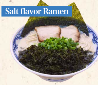
Salt flavor Ramen Salt flavor ramen with seaweed topping しお岩磯のりらーめん 900