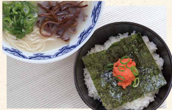
Mentaiko topping 850 明太子ごはんセット