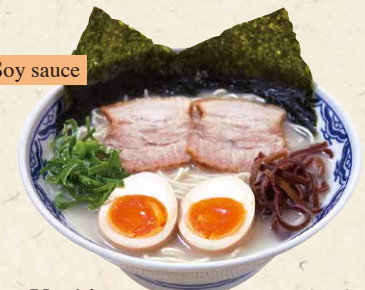
Yoshimaru ramen 870 Classic ramen with two popular toppings. 由丸らーめん