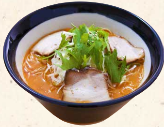
Tonkotsu Tantanmen mixture of pork soup and sesame paste とんこつ担々麺 920

We make our signature soup for 8 hours from carefully selected pork bone.