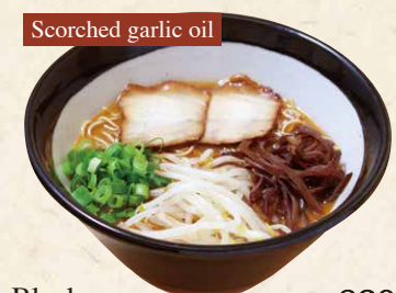
Black ramen 820 Superb stock cooked with Ma oil (scorched garlic oil) from Kumamoto. 黒らーめん