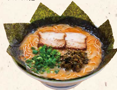
Karakamen mixture of pork soup and spicy green chili paste からか麺 920