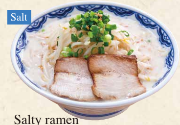
Salty ramen with bean sprouts 820 Garlic-flavoured salty pork tonkotsu soup with bean sprouts. 塩もやしらーめん