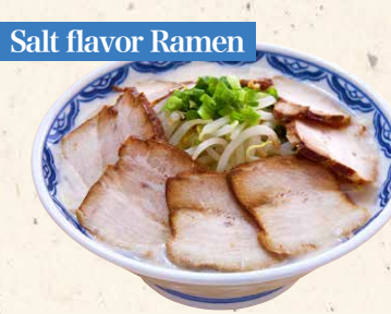
Salt flavor Ramen Soybean sprouts ramen with Chashu(sliced pork) topping 塩もやしチャーシュー麺 1000