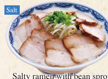
Salty ramen with bean sprouts and sliced pork 1020 Bean sprouts and sliced boneless pork rib for a generous portion. 塩もやしチャーシュー麺