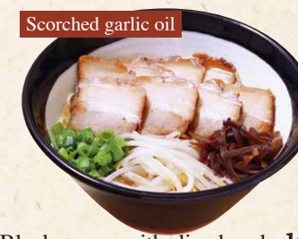
Black ramen with sliced pork 1020 A generous serving of Ma oil (scorched garlic oil) stock and sliced pork. 黒チャーシュー麺