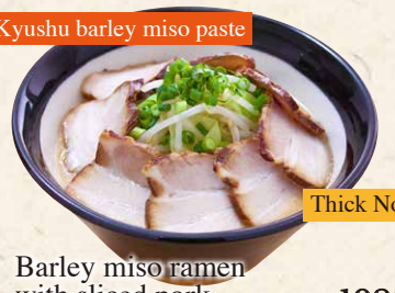
Barley miso ramen with sliced pork 1080 A generous portion of homemade barley miso and sliced pork. 麦味噌チャーシュー麺