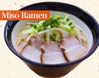
Miso Ramen Mugimiso ramen 麦味噌らーめん 850