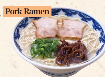
Pork Ramen Hakata ramen 博多らーめん 700