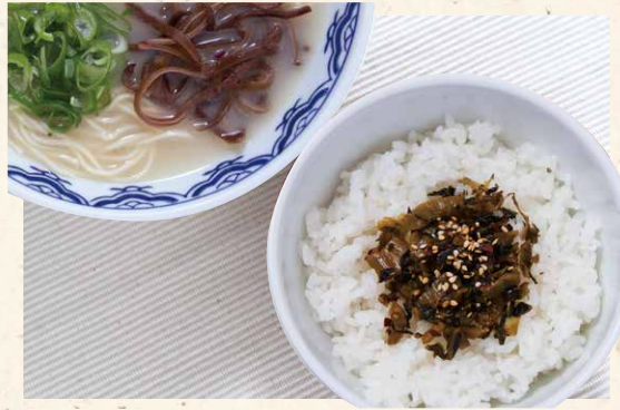
Takana topping 800 高菜ごはんセット