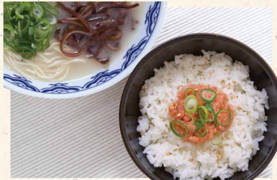
Salmon & mentaiko topping 850 鮭明太ごはんセット