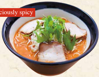
Spicy Szechuan Style pork tonkotsu ramen 950 The homemade chilli oil is addictive. とんこつ担々麺