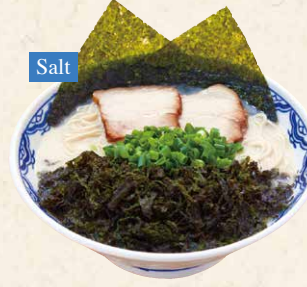
Iwaiso nori seaweed ramen 920 Using nori seaweed enhances the flavour of the stock. しお岩磯のりらーめん