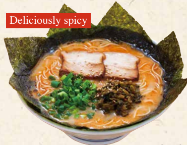
Karaka ramen 950 Try this pork tonkotsu stock flavoured with yuzu (citrus) pepper. からか麺