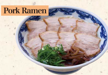
Pork Ramen Hakata ramen with Chashu (sliced pork) topping 豚ばらチャーシュー麺 900