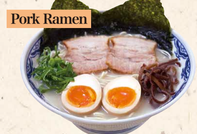
Pork Ramen Hakata ramen with seaweed, Chashu(sliced pork) and boiled egg topping 由丸らーめん 850