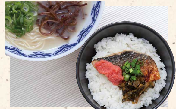
Grilled mackerel & mentaiko topping 900 焼きサバ明太ごはんセット

LUNCH TIME 11:00 ~ 15:00 / 11:00 ~ 14:00 NO-SMOKING TIME