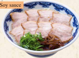
Boneless pork rib ramen 920 Includes generous helpings of sliced boneless pork rib with a delicious meaty flavour. 豚ばらチャーシュー麺